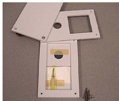
FIGURE 3 (alternative method, standard phantom)

(Alternative method for P1010 standard dosimeters such as ceric-cerous or dichromate ampoules or PMMA: Place the dosimeter ampoules into the square well and the alanine transfer dosimeter into the circular well. Secure all dosimeters in place so that they do not shift during irradiation. See Figure 3 below.)