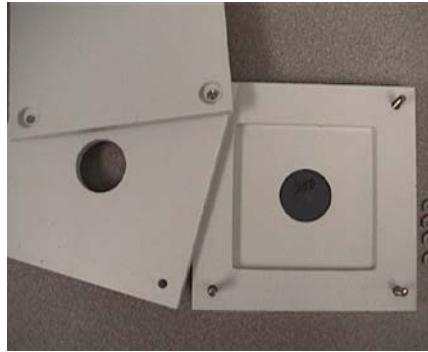
FIGURE 1 (small phantom)