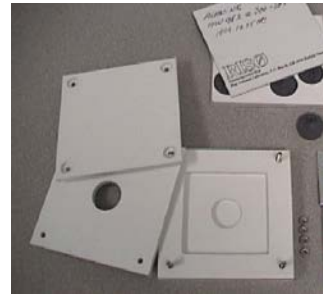
Small Gamma Phantom