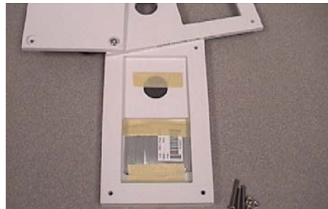
FIGURE 2 (standard phantom)

(Alternative method for P1010 standard dosimeters such as ceric-cerous or dichromate ampoules or PMMA: Place the dosimeter ampoules into the square well and the alanine transfer dosimeter into the circular well. Secure all dosimeters in place so that they do not shift during irradiation. See Figure 3 below.)