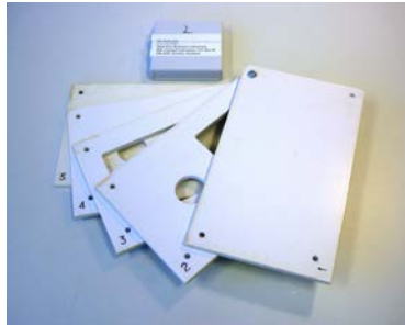
Standard Gamma Phantom